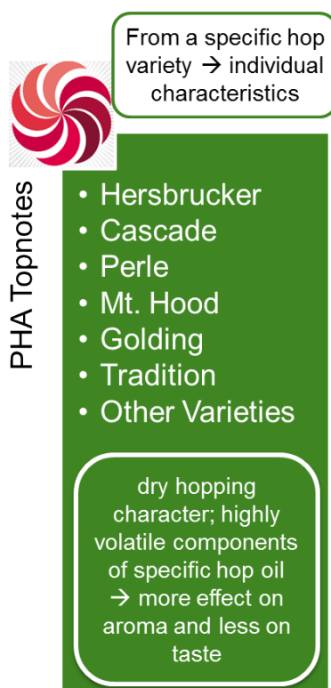
Figure 1: PHA® Topnotes

PHA® Topnotes products are a hop extract in an aqueous propylene glycol carrier, produced by a proprietary physical separation process. It is considered as GRAS (FEMA no. 2580 – Hops, oil). Propylene glycol is registered as a food additive according to Annex II of EU Reg 1333/2008 as well as E1520 and PG is a permitted carrier for flavors as per regulation 2006/52/EC. PHA® products are exclusively supplied worldwide by BarthHaas.